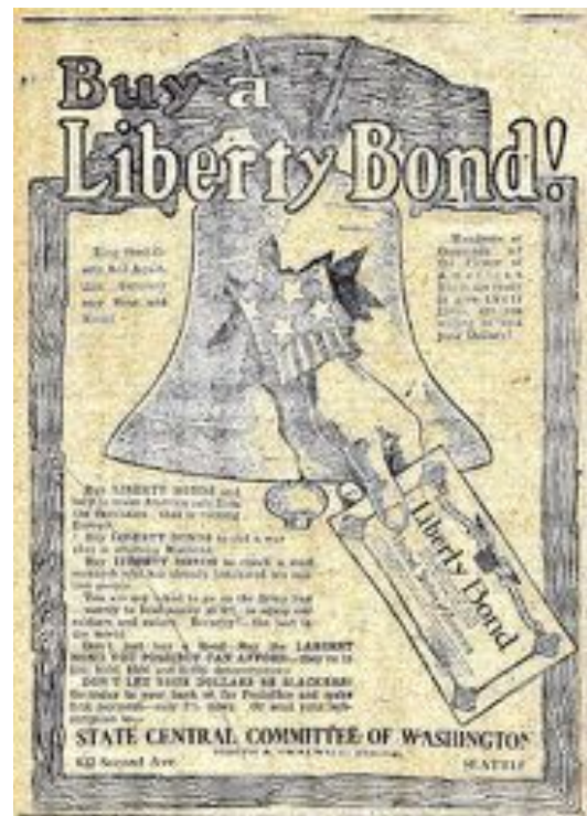
Sumner News Index. 10-19-1917

Montgomery Ward and Sears-Roebuck mailed two million flyers to farm women.